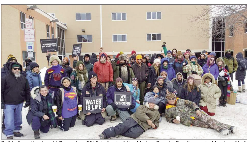
Solidarity action in mid-December 2016 in front of the Morton County Courthouse in Mandan, North Dakota to support arrested protectors and Legal Observers.