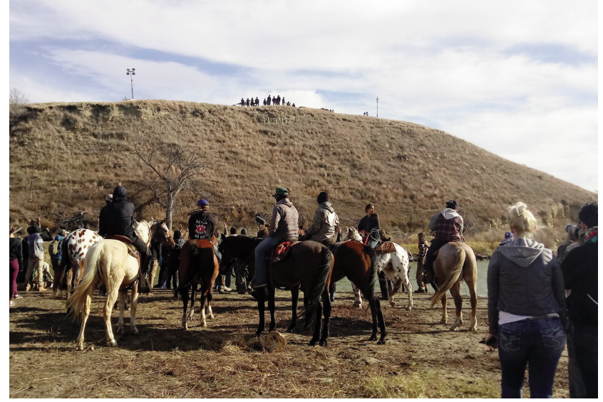
October action at Turtle Island River, which ended with water protectors being brutally attacted - maced and tear gas sprayed - by law enforcement forces.

Thursday, November 3, 2016 Jude and I spent another day working for the Red Owl Legal Collective at Standing Rock. After days of fighting we finally saw the last three water protectors arrested last Thursday released from jail. Three brave men who spent a week in jail for