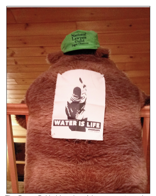
The Power Behind Legal - A bear mascot wearing the NLG Legal Observer hat.